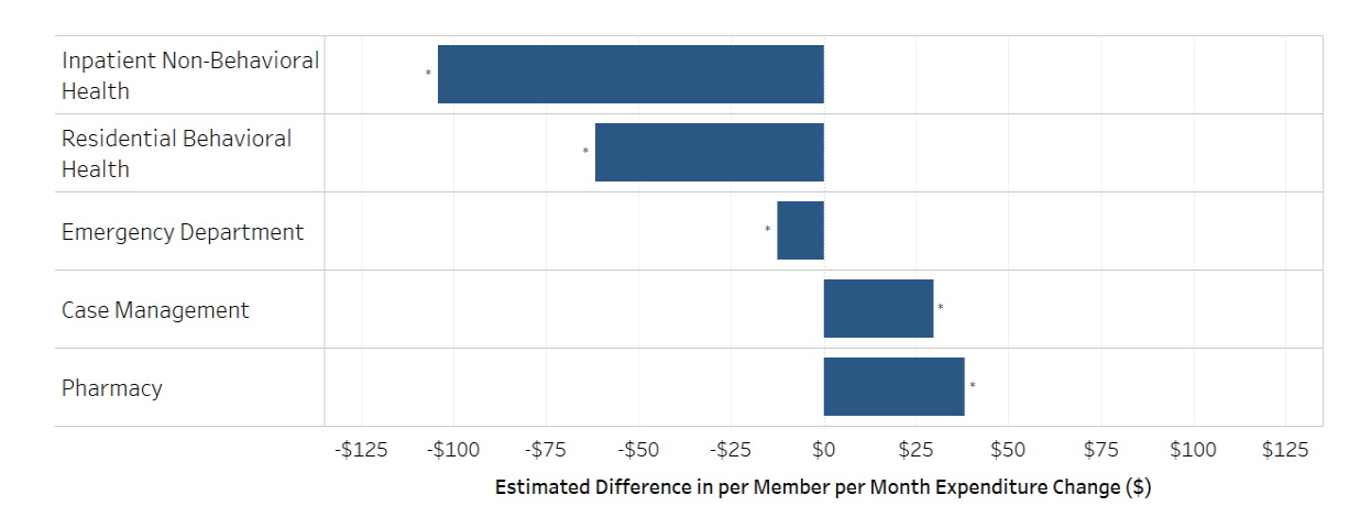
Figure 3: Adjusted Change in Adult PMPM Spending from Baseline to 3 Years after PSH Entry, PSH vs. Comparison Group

Notes: Positive and negative dollar amounts represent the estimated change in spending for PSH recipients for the given year per person per month relative to the change in spending in the comparison group, after adjusting for relevant covariates. Asterisks indicate changes that are statistically significant at the 0.05 level.