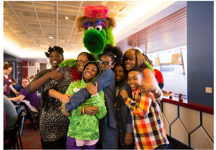
Event attendees had the opportunity to meet Phoebe Phanatic.