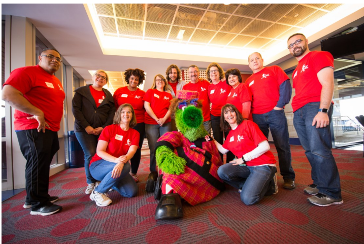
Matching event staff pose with Phoebe Phanatic.