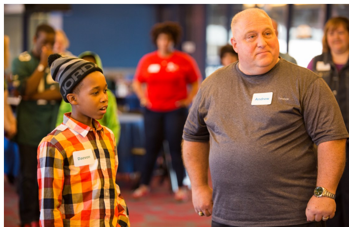
Youth and families participate in icebreaker and teambuilding activities.