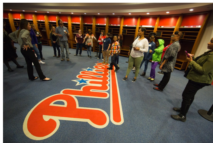
Event attendees tour Citizens Bank Park.

about a child on a website.” One of the families in attendance agreed sharing, “The group activities with the kids were the most valuable part of the day. Meeting the kids in person is a lot better than reading or hearing about them from the website or hotline.”