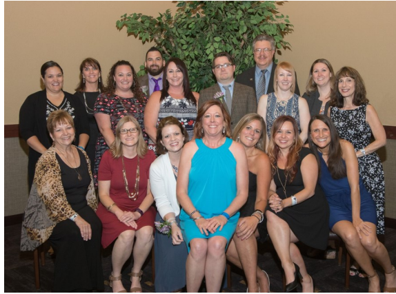
The conference planning committee worked tirelessly to ensure that this year's conference was better than ever.