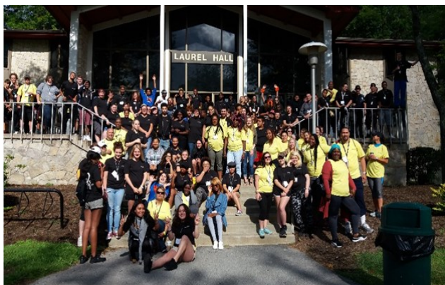
Retreat Attendees and staff pose for a group photo outside Laurel Hall.