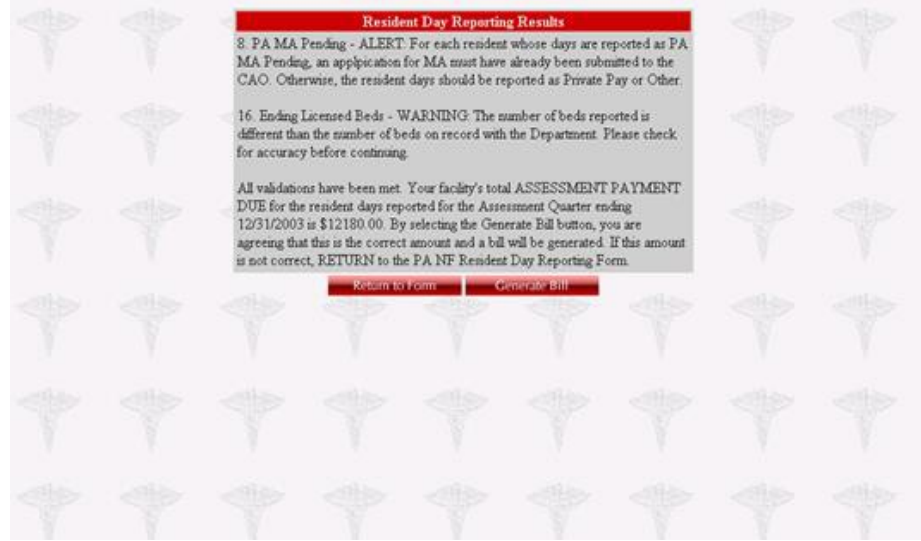
Figure 6 - Submission Results if No Errors

After selecting the Generate Bill button, a bill is generated. Select File, then Print and print a copy of the bill. See AppendixB for an example of a bill. Upon printing the bill, choosing the browser's back button or choosing ESC, the user is returned to the Resident Day Reporting and Payment History screen. Select the Log Out button to exit that provider's data.