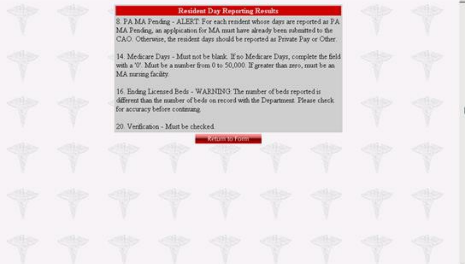
Figure 5 - Submission Results with Errors

If the user does not wish to submit the data at this time, they may select the Return to Form button or exit the program. To submit the saved data at a later time, select <u>Edit</u> for the appropriate Resident Day Quarter on the Quarterly Resident Day Reporting and Payment History screen (Figure 3 on page 8). Data that is saved, but not submitted, does not fulfill the nursing facility's obligation to submit the completed RDR Form and generate a bill.