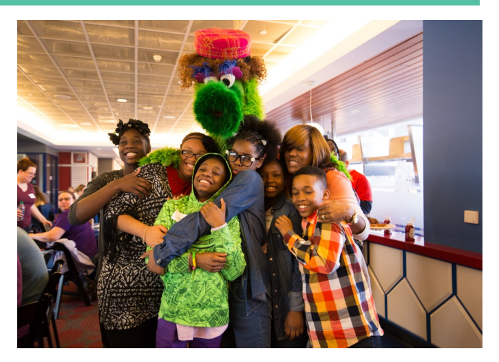
Event attendees had the opportunity to meet Phoebe Phanatic.

After lunch, everyone in attendance received a very special behind-the-scenes tour of Citizens Bank Park. The tour included areas that are typically closed to the general public, including the batting cages, dugout, press conference room, and locker room. The tour really was a "phan-tastic" treat!