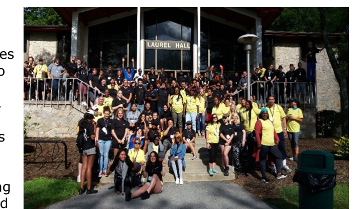
Retreat Attendees and staff pose for a group photo outside Laurel Hall.